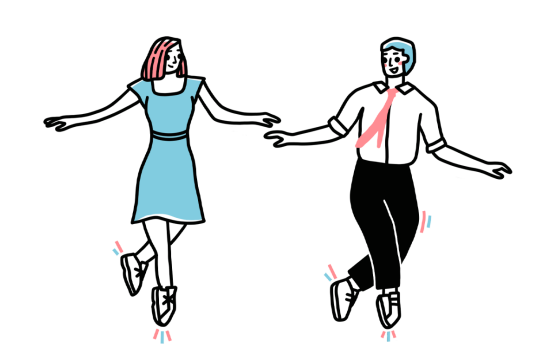
3. STEP IT FORWARD