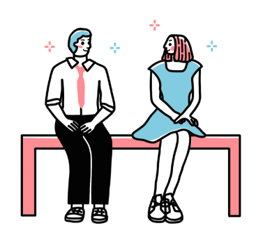
1. TAKE A SEAT

You will need: bright colours, the Hollywood hills, a lovely night.